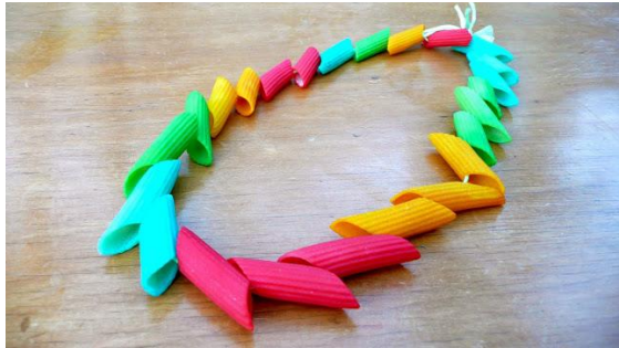
Day 4: Pasta Necklace