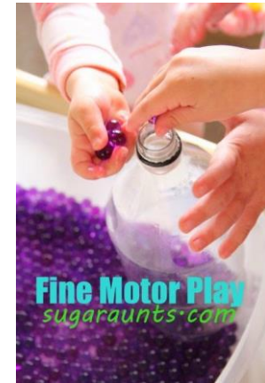
Day 8: Place water beads into 2-liter bottle