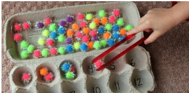
Day 10: Pom poms into egg carton with tongs