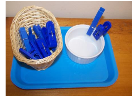
Day 26: Pinch clothespins on Tupperware Container