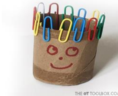
Day 15: place paper clips on paper towel tube