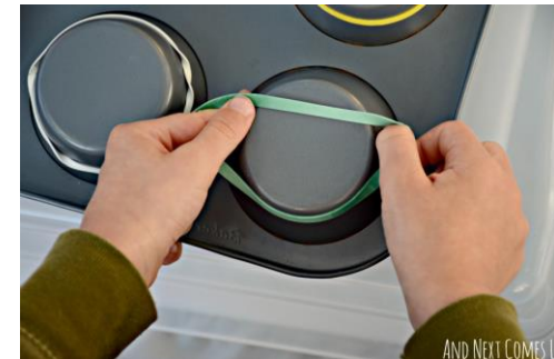
Day 17: Rubber bands around muffin tins