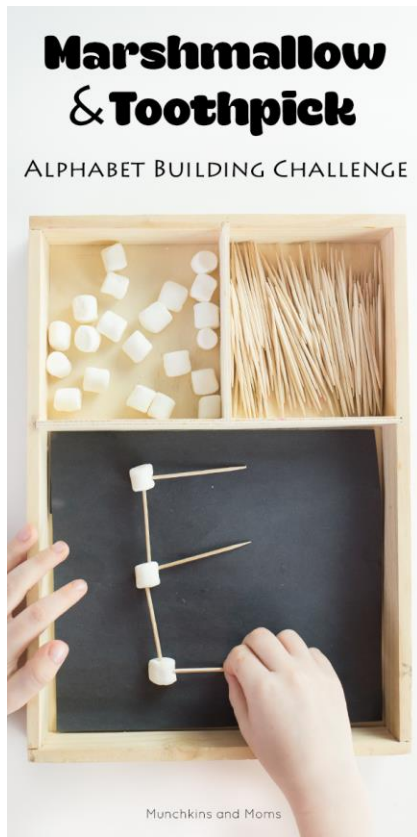
Day 22: Alphabet toothpicks with marshmallows