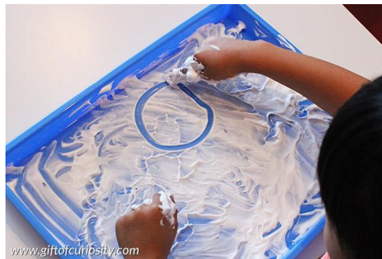
Day 24: Shaving cream letters